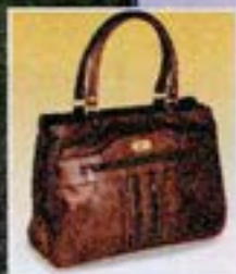
Available in Brown