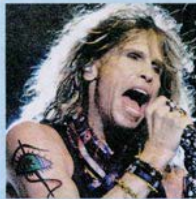
Aching rocker Steven Tyler needs time to get back on his feet